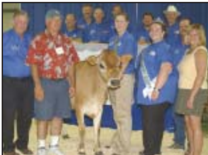
MVF Paramount Golda 1218-ET is the high selling heifer in 49 years of the National Heifer Sale.